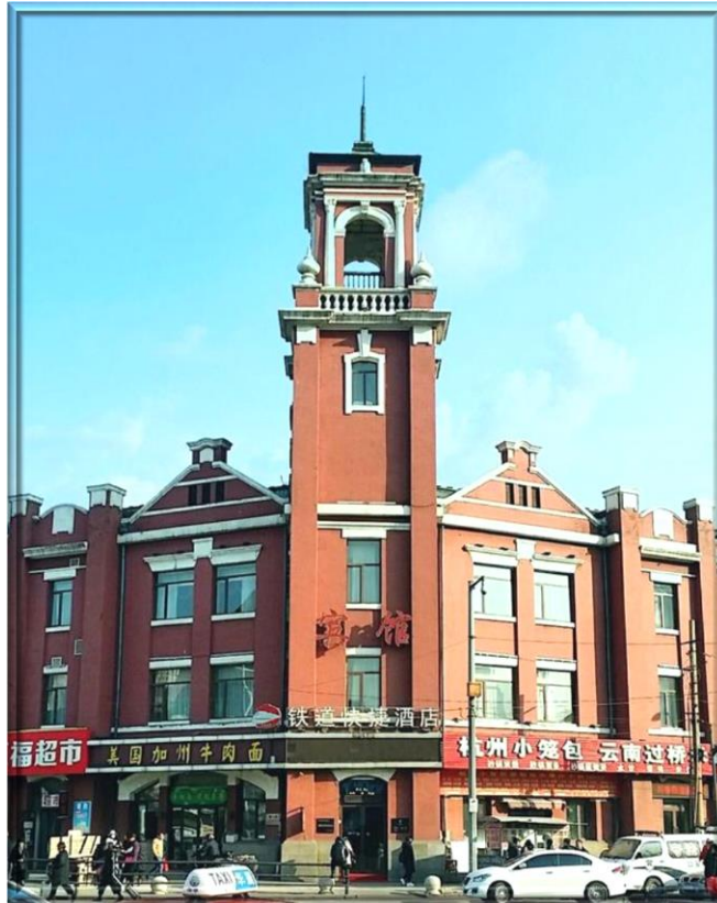
The former building of the Railway Hotel (鐵路賓館) where the Shen-Yang Rotary Club held its regular weekly luncheon meetings.