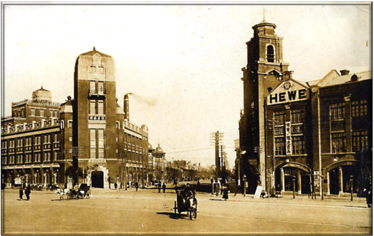
Scene of Naniwa Street, Mukden, (奉天浪速通) in 1929 (today Zhongshan Road 中山路) -- the Yue Lai Inn (悅來客棧) (left) was located to the opposite of the Mukden Railway Station (奉天驛).