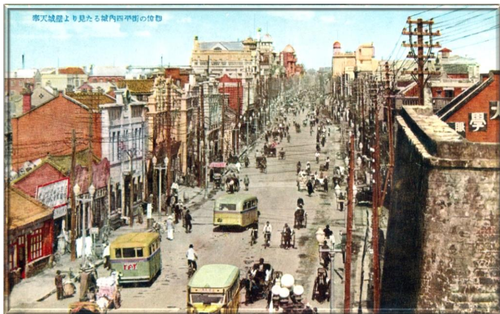
Mukden street scene during the Manchukuo era