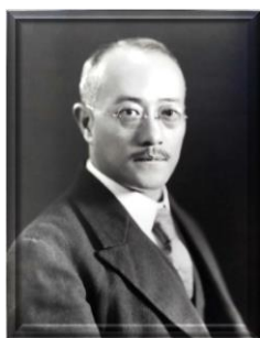
王正廷 Chengting T. Wang

In accordance with the official city name be “Shenyang” as decided by the municipal government, the Club changed its name as “Shen-Yang Rotary Club (瀋陽扶輪社)” commencing on 1 July 1948. Later on 1 July 1949, Rotary International renumbered all districts world-wide. The 98th District was changed to “59” until it was dissolved at the end of 1951.