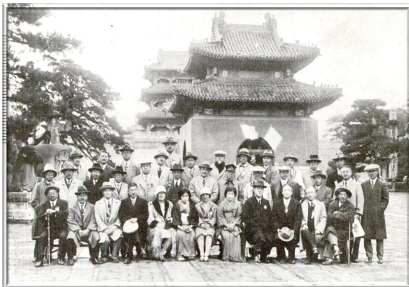
Delegates from Dairen and other Rotary clubs attend the charter night at Mukden. The picture shows the delegates touring the older section of the city where the Imperial Ch’ing palaces and tombs remain as they were centuries ago.

formed the “on-to-Dairen-and-Mukden committee” that week as a way to drum up support for a joint business trip to those cities by Tokyo Rotarians. Forming such a committee was standard procedure in Rotary’s brand of boosterism. When the Dairen-Mukden Charter Night came to pass in early October 1929, 72 Rotarians and spouses from Tokyo arrived in the Dairen harbour and were greeted by “ Rotary flags streaming upon the roof of the pier, and many members with ladies waiting to welcome us. ” At the celebration dinner itself, “ the dining room was tastefully decorated with the flags of many nations and that of Rotary International. Vice-President Ohdaira [of the new Dairen Rotary Club] ... spoke of the phenomenal growth Rotary is making throughout the world” while the Club’s other Vice-President, Furusawa, told of “ how the Club had been originally conceived and brought into existence through the kindness of Tom Sutton. ” Since Tom Sutton, Rotary International President 1928-1929, had given active support to the idea of establishing clubs in these cities while presiding over the Second Pacific Rotary Conference hosted by Tokyo in the fall of 1928, the boosterism of Suzuki, Ohdaira, and Furusaws carried the imprimatur of Rotary International’s highest officials.