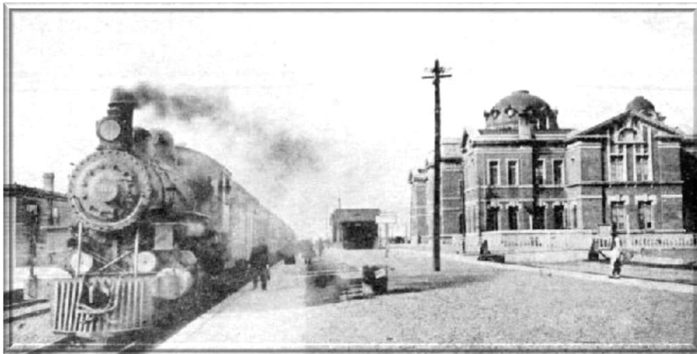
1938 – Express “Asia” leaving the Mukden Railway Station (奉天驛) which was established in 1909.