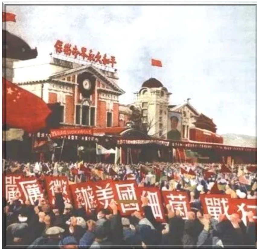
Outbreak of Korean War on 25 June 1950 made the Communist China and USA in hostility. War against USA demonstration rally was held in front of the Shenyang Railway Station.