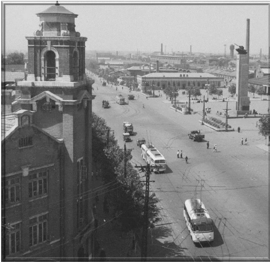
Yue Lai Inn (悅來客棧) was renamed as Shenyang Hotel (瀋陽飯店) (left) in 1950, overlooking the Railway Station.