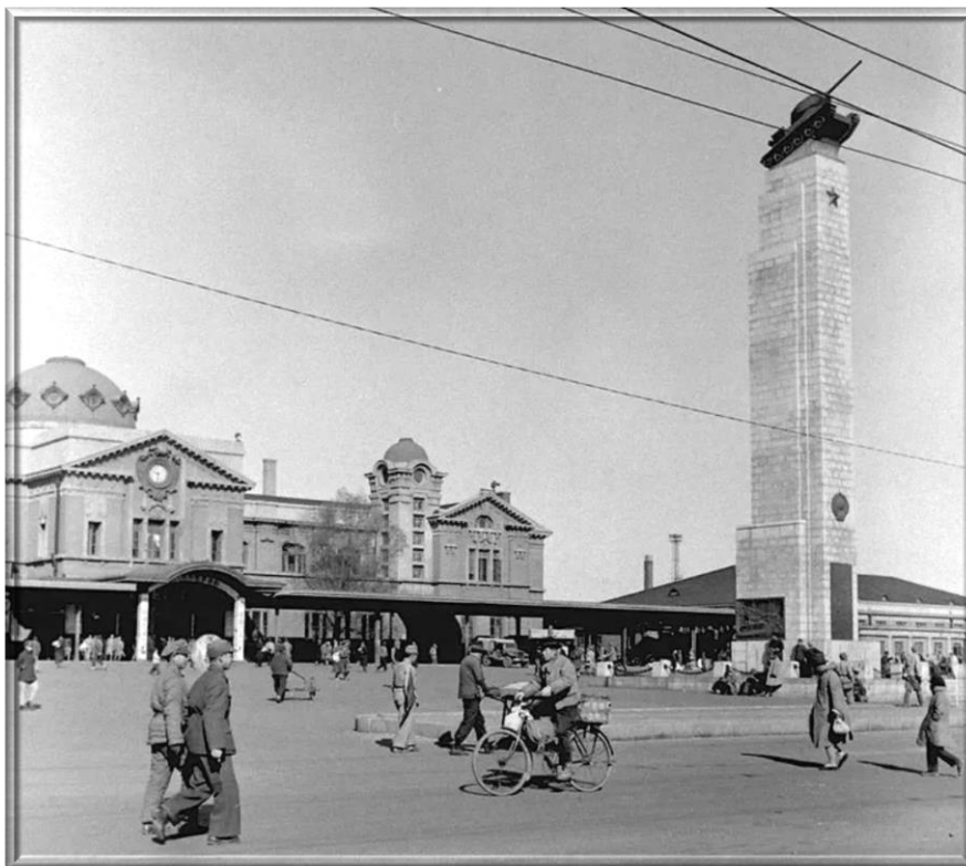
In October 1945, a Soviet Union War Memorial Baikal Tank Monument was erected in front of the Railway Station. In 1946, Mukden Railway Station (奉天驛) was re-named as Shenyang South Station (瀋陽南站).