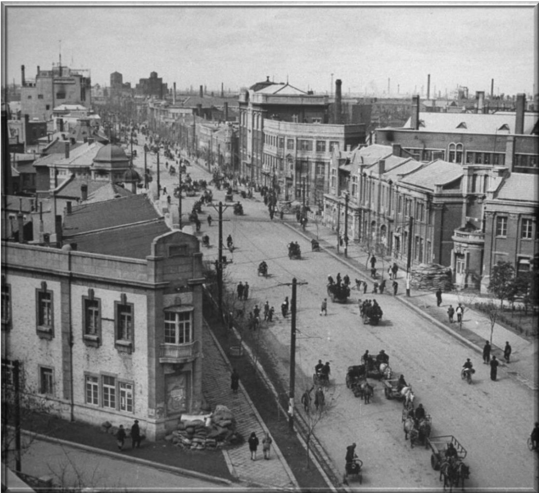
Shenyang street scenes as in 1946