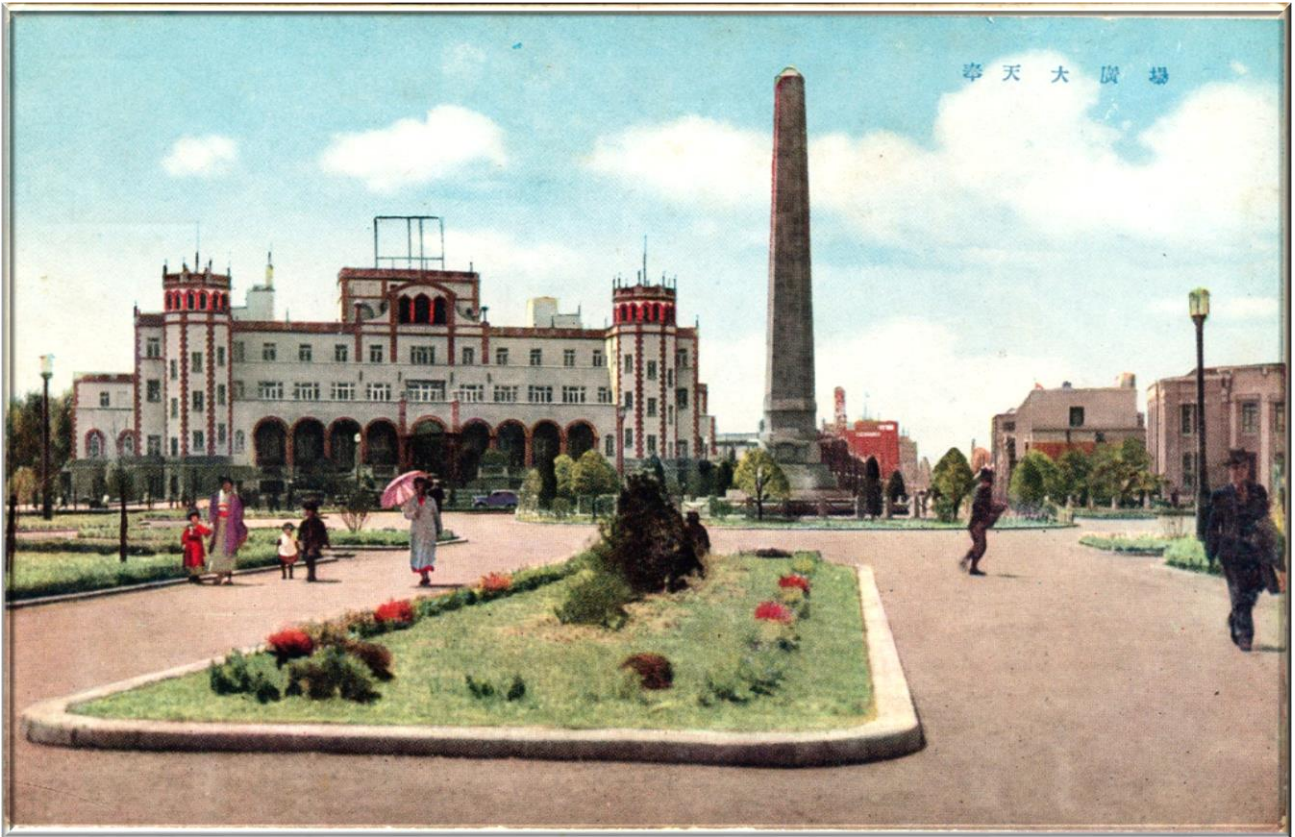
The Yamato Hotel, Mukden (奉天大和旅館), where the Rotary Club held its regular weekly luncheon meetings.