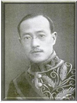
王正廷 Chengting T. Wang