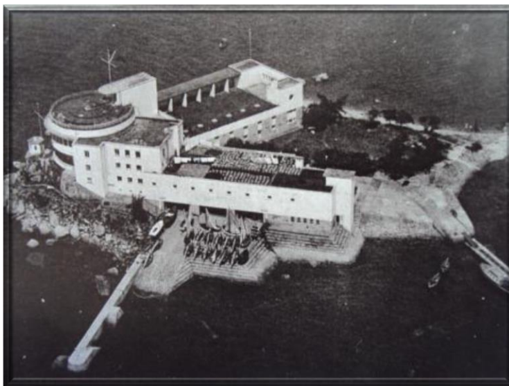
1940s – The Royal Hong Kong Yacht Club located on the Kellett Island at the Causeway Bay off the Hong Kong Island northern coast.