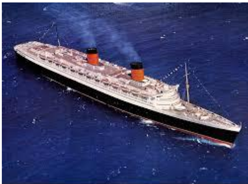
R.M.S. Queen Elizabeth