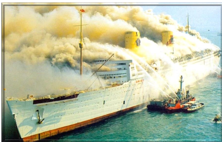
1972 -- The demise of the Seawise University, aka Queen Elizabeth liner, in Hong Kong harbour

In recognition to his success in refloating the “Conte Verde”, in 1939 Edward was invested with the Insignia of Commendatore of the Crown of Italy.