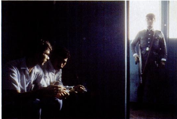
An ICRC delegate visits a political prisoner in El Salvador.

In a dark cell where light filters in only to cast barred shadows on a blank wall, a visitor sits listening to a detainee.