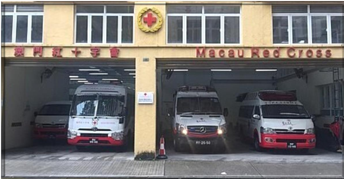
Macau Red Cross Medical Transfer Ambulance Command in Areia Preta (黑沙環)

Association of Architects; Founder & Chairman 1989-1997 of Portuguese Association of Accountants, Macau; Founder & Life Advisor of Macau Management Association; Member of Portuguese Association of Architects, Portuguese Association of Marketing, Portuguese Association of Quality Control; President 2007-09 & 2013-15 of International Federation of Non-Government Organizations for the Prevention of Drug and Substance Abuse (IFNGO).