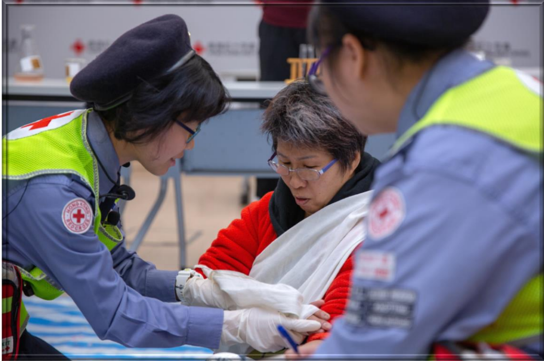
Hong Kong Red Cross Youth Units (香港紅十字會青年團), aged 12-17, in First Aid training