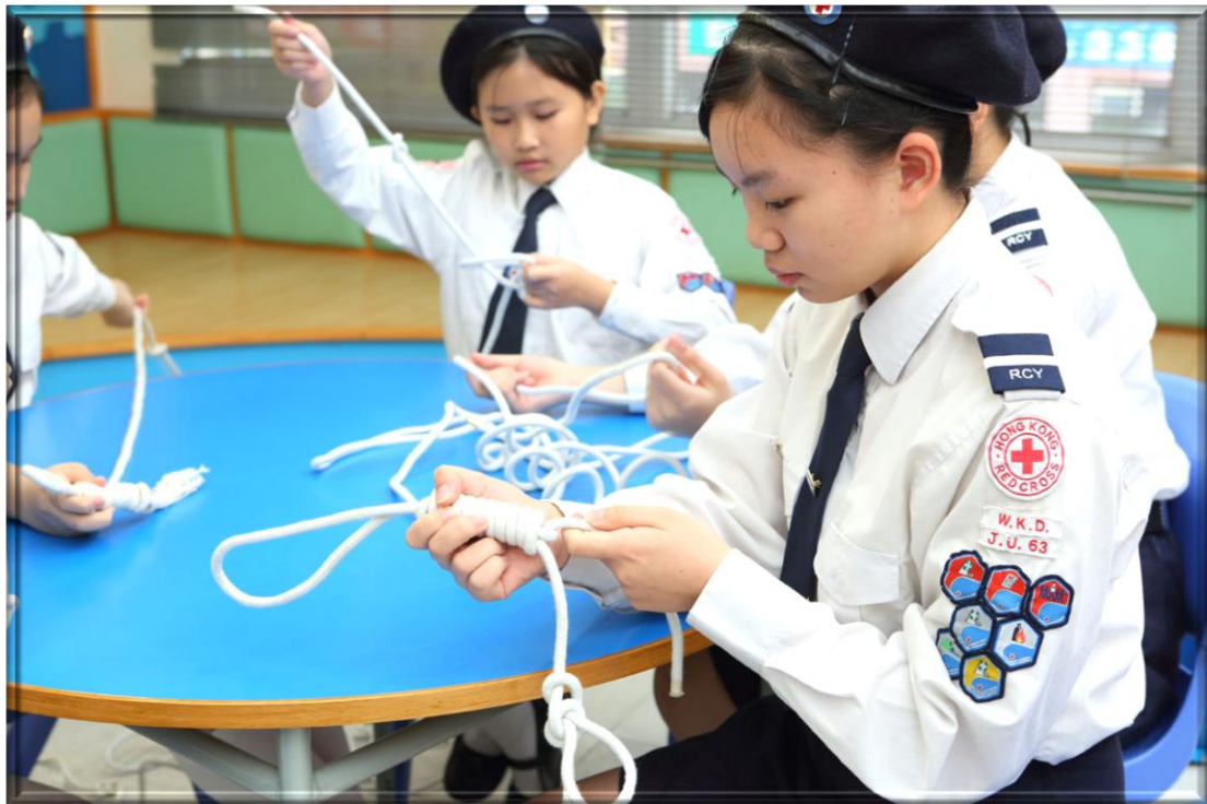
Hong Kong Red Cross Junior Units (香港紅十字會少年團) in primary schools