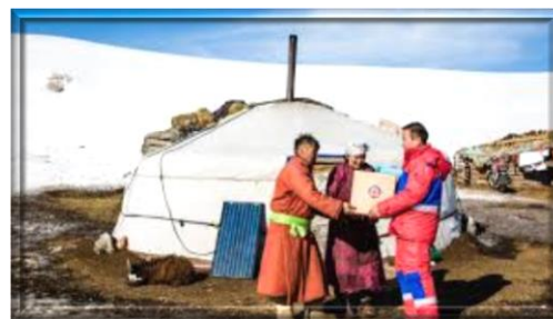
Mongolian Red Cross snow disaster relief