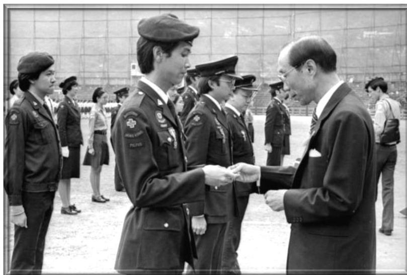
12 March 1978 -- Sir Run Run Shaw (right), President of the Hong Kong Red Cross Society, presenting long-service awards to Red Cross members.