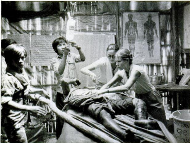
An ICRC medical team provides emergency care to a wounded Khmer refugee at a hospital in Kao Dang, Thailand, near the fighting along the Kampuchean border.

disasters, and assists refugees outside conflict zones.