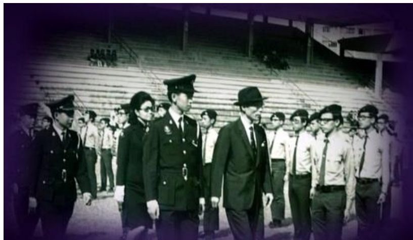
Rotarian Run Run Shaw (right) inspected the parade by Hong Kong Red Cross youth members in 1970.

After Shaw stepped down from the presidency in 1998, he remained to serve as the Vice Patron for 15 years. To further promote Hong Kong Red Cross services, as now an autonomous branch of the Red Cross Society of China (中國紅十字會) since 1 July 1997, Shaw generously donated HK$126 million, the largest individual donation to the Society by far, to fund the building of its new headquarters. The new building is named as [Hong Kong Red Cross Headquarters Run Run Shaw Building 香港紅十字會總部邵逸夫樓] upon its completion in early 2015, located in West Kowloon.