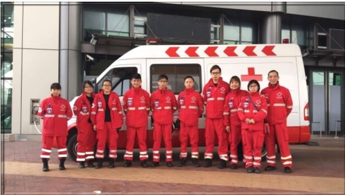
Macau Red Cross voluntary first-aiders and ambulance brigade