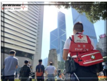
Hong Kong Red Cross First-Aider

The Blood Donor program works with related government and non-governmental organizations to recruit and increase the number of voluntary, non-remunerated blood donors. The Red Cross societies may also operate blood banks in providing fresh blood supply to the local hospitals in cases of emergency.