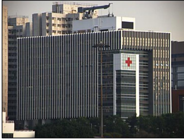
Hong Kong Red Cross Headquarters Run Run Shaw Building 香港紅十字會總部邵逸夫樓