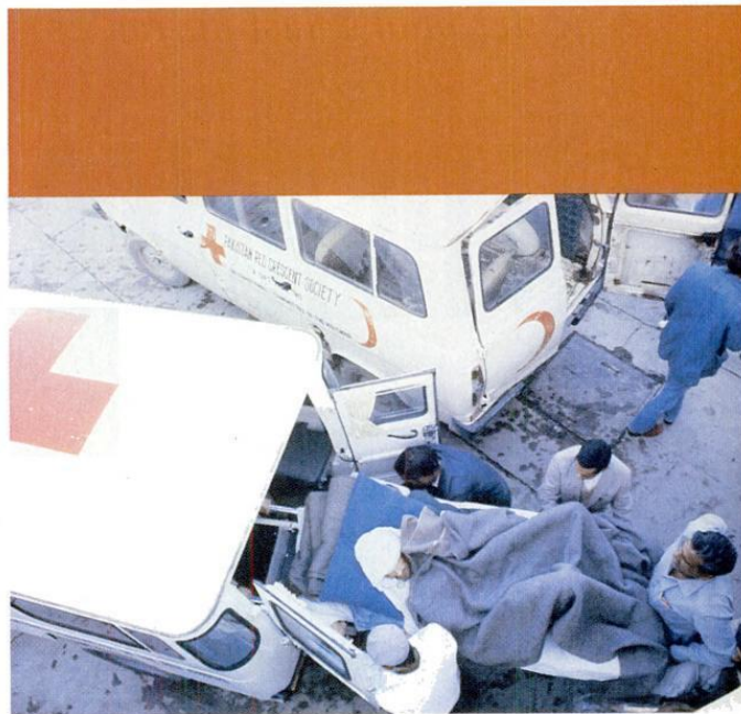
In Peshawar, Pakistan, near the Afghanistan border, the Pakistan Red Crescent Society rushes a wounded Afghan war victim to the hospital. Mobile Red Crescent teams, supported by the ICRC, treated 1,478 war wounded at first-aid posts along the Afghan/Pakistani border in 1985.

With the increased number of conflicts in the world,