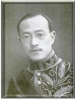
王正廷 Chengting T. Wang