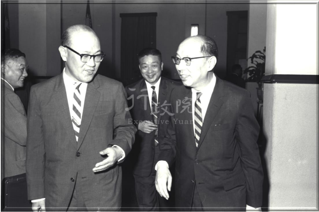
1964年5月9日行政院嚴家淦院長(右)及新聞局沈劍虹局長出席新聞聯絡會議。 9 May 1964 -- Executive Yuan President Yen Chia-Kan (right) and Government Information Office Director James Shen jointly attended the press liaison meeting.