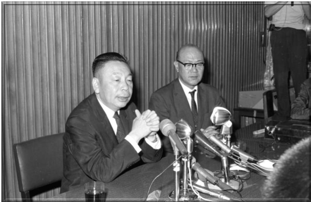
1966年 -- 中華民國國防部長蔣經國(左)訪問大韓民國後召開記者會，新聞局沈劍虹局長陪同。 1966 -- Chiang Ching-Kuo (left), Defense Minister of the Republic of China, holds a press conference after visiting the Republic of Korea, accompanied by James Shen, Director of Government Information Office.