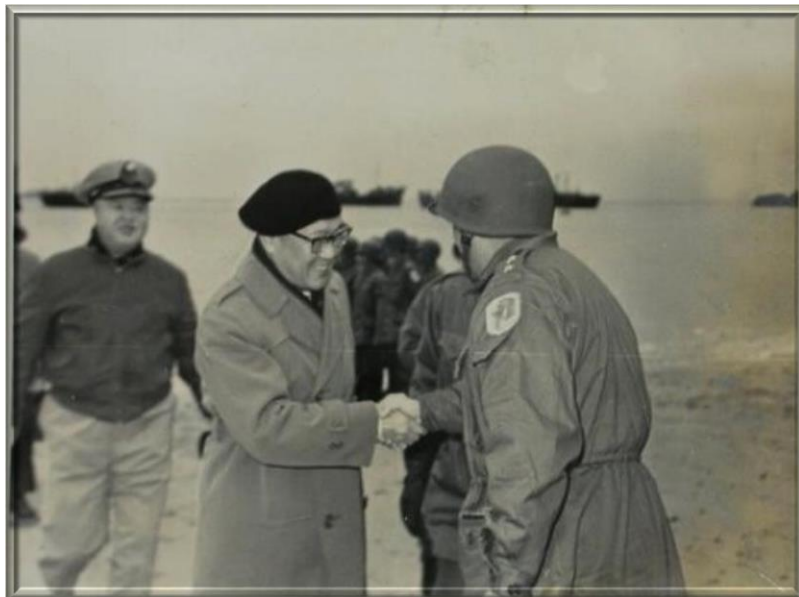
1964年2月4日 -- 金門八二三砲戰期間，新聞局沈劍虹局長帶領各國駐華記者團 20 餘人 前往馬祖、北竿採訪戰況，國軍司令官迎接代表團一行。

31 October 1962 -- The first Golden Horse Awards ceremony was held in Taipei. Government Information Office Director James Shen (L4) served as the Chairman, and the awards presentation was officiated by the Executive Yuan Vice President Wang Yun-Wu (L5).