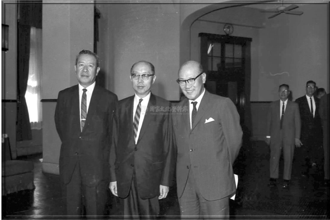
1966年10月5日 -- 沈劍虹宣誓就任中華民國駐澳大利亞大使，嚴家淦副總統(中)代表蔣中正總統監誓。 5 October 1966 – James Shen was sworn in as the Ambassador of the Republic of China to Australia. Vice President Yen Chia-Kan (middle) administered the oath on behalf of President Chiang Kai-Shek.