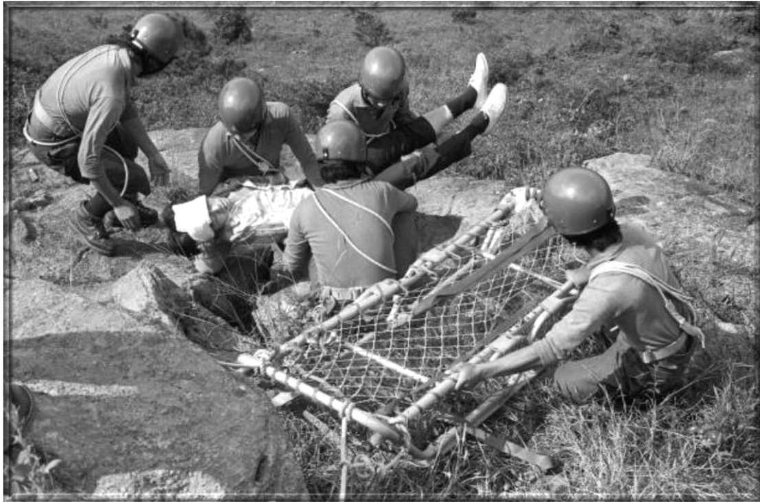
25 October 1977 -- The Mountain Rescue Unit of the Civil Aid Service helping a victim during an exercise on Beacon Hill.