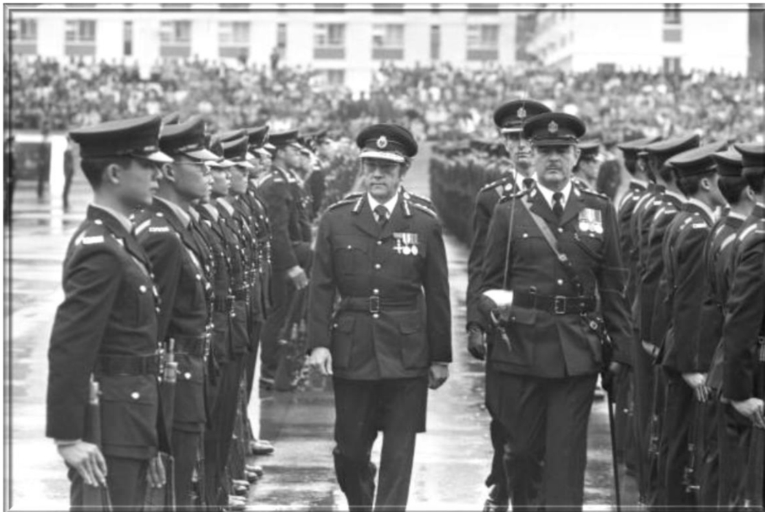
31 December 1977 -- Roger Lobo (centre), Commissioner for Civil Aid Service, inspecting a passing-out parade staged by policemen at the Aberdeen Police Training School.