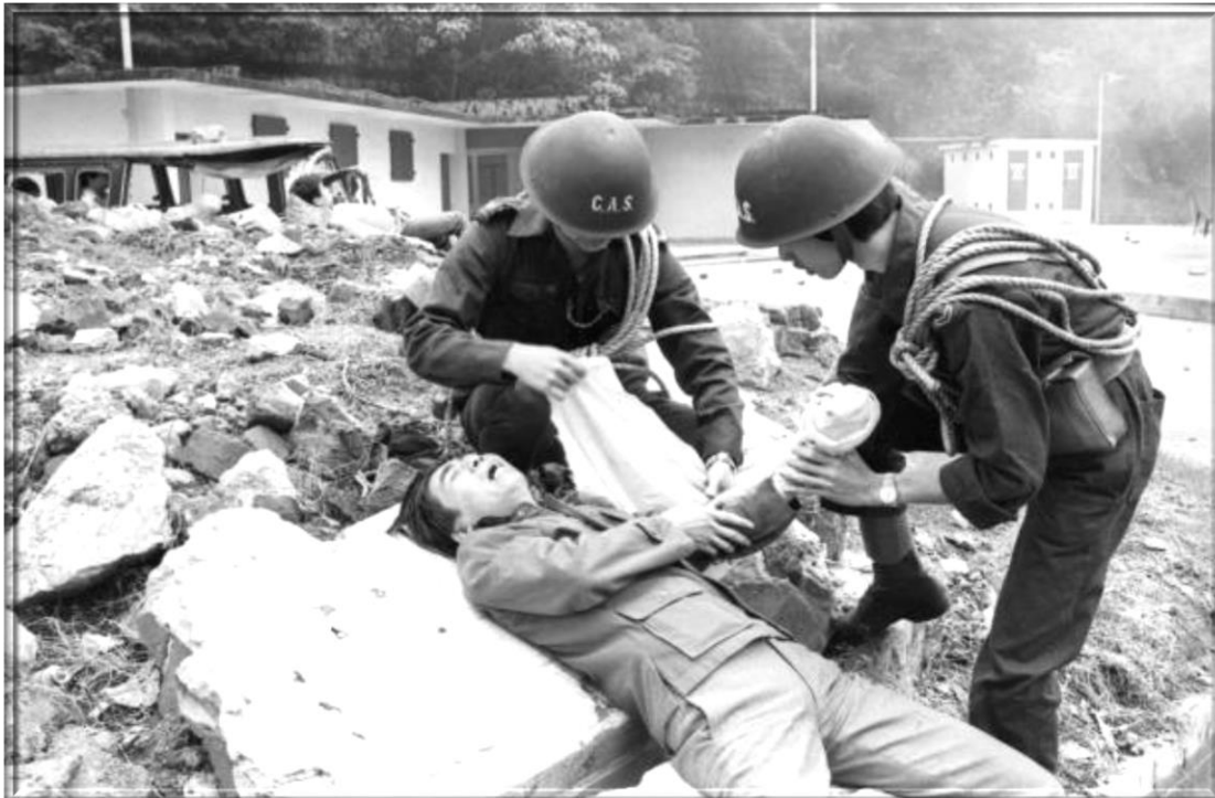
12 March 1978 -- Civil Aid Service volunteers rescuing "victims" during an operational exercise on typhoon emergency work in Kowloon. The idea of the exercise was to test the preparedness of all CAS personnel before the start of the typhoon season.