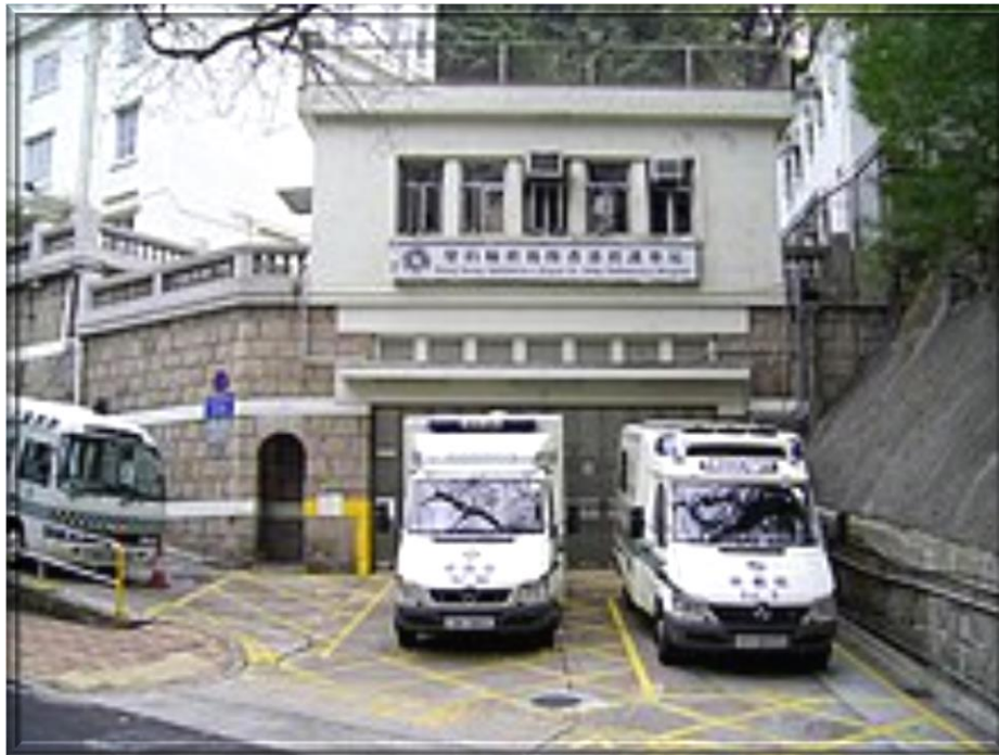
St. John Ambulance depot at 2 Tai Hang Road, Causeway Bay, Hong Kong Island.