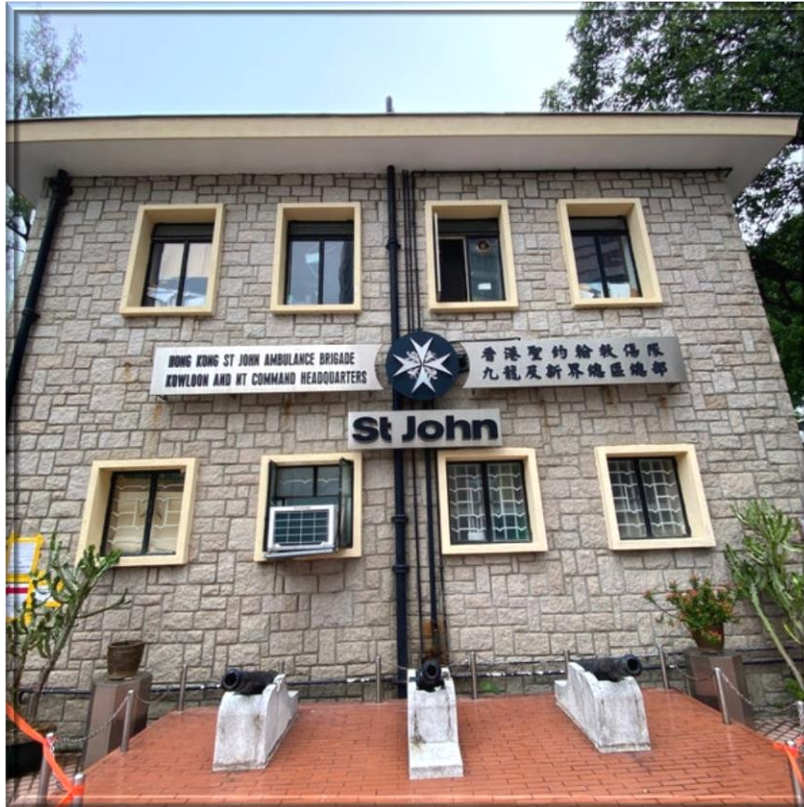
St. John Ambulance Brigade Kowloon & New Territories Command, 104 Waterloo Road, Kowloon.