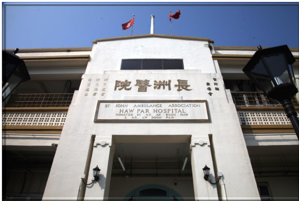
Hong Kong St. John Ambulance Association Haw Par Hospital (長洲醫院), Cheung Chow Island A gift from Mr. Aw Boon-Haw (胡文虎) and Mr. Aw Boon-Par (胡文豹) in 1934. Today, this hospital is operated directly under the Hong Kong Hospital Authority.