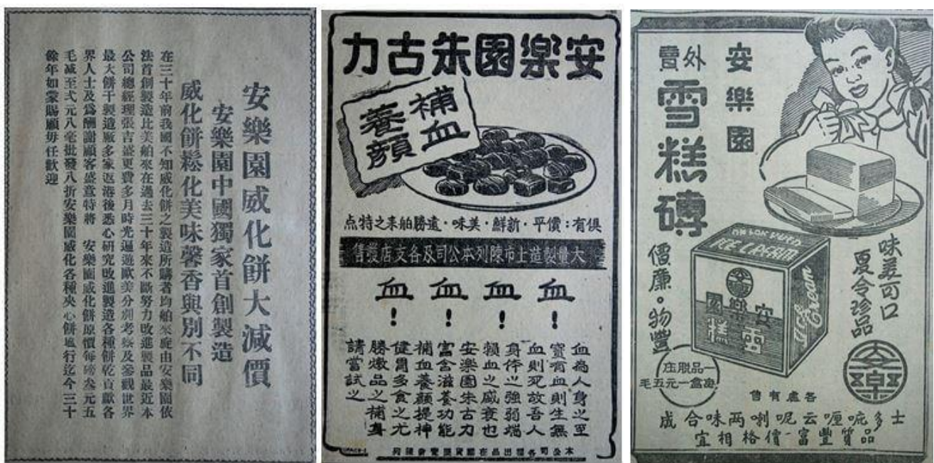
Advertisements of On Lok Yuen biscuits, chocolate and ice cream