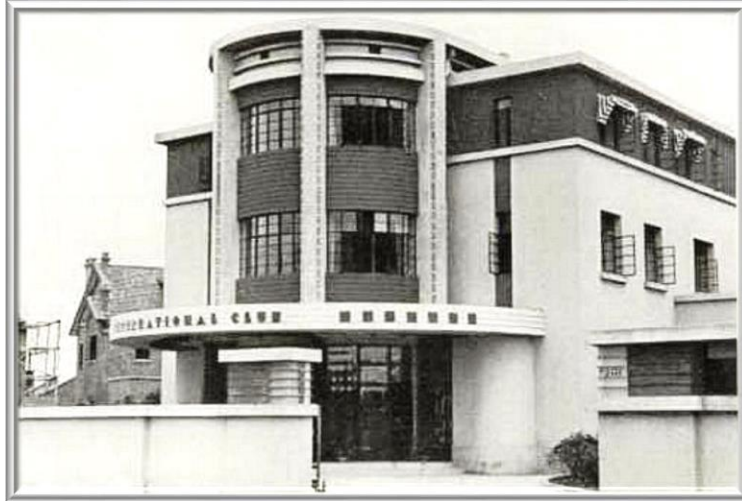
南京國際聯歡社(隸屬外交部) Nanking International Club (Foreign Affairs Ministry)