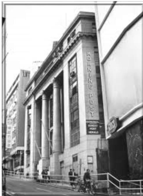
1926-1970 -- South China Morning Post Building at Wyndham Street, Central District, Hong Kong.

Warships in harbour transmitting messages have been overwhelmed with work and, with Cable and Wireless facilities out of action for a few days there has been almost complete silence between Hongkong and the outer world. This is evidenced by the scant references to the Colony in British broadcasts despite the radio talks given by a foreign news commentator and the messages filed by correspondents travelling.