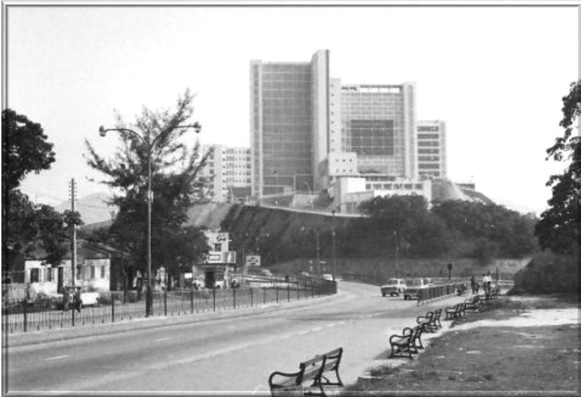
Opened in 1967, closed in 1996, then demolished, the British Military Hospital had been the iconic structure on Wylie Road, King's Park, Kowloon, Hong Kong.