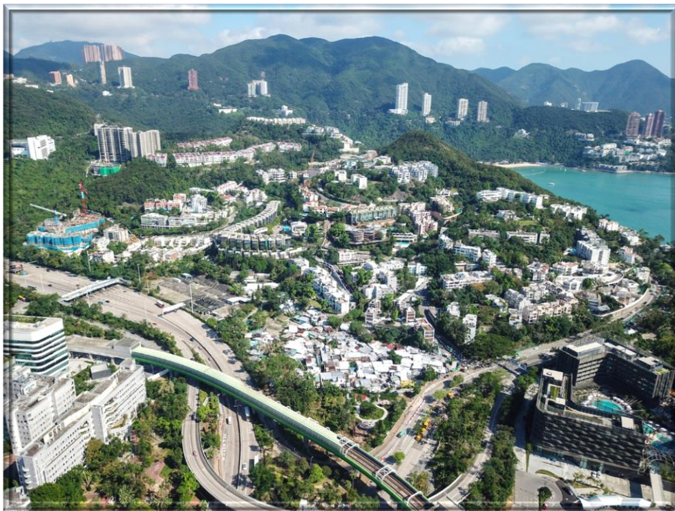
壽臣山今日的景色 View of Shouson Hill today