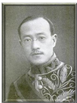
王正廷 Chengting T. Wang