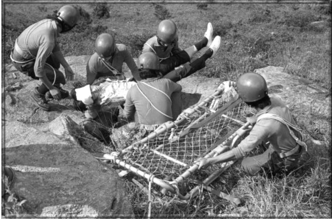
25 October 1977 -- The Mountain Rescue Unit of the Civil Aid Service helping a victim during an exercise on Beacon Hill.