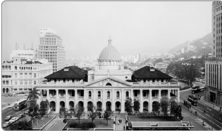
The old Supreme Court building has been the house of the Legislative Council from 1985 until 2011.

This article attempts to list out those Rotarians who had served the British Crown Colony Hong Kong Legislative Council (英屬香港立法局) as Presidents (主席) / Members (議員) / Secretary General (秘書長) before 1 July 1997, in alphabetical order of their surnames.