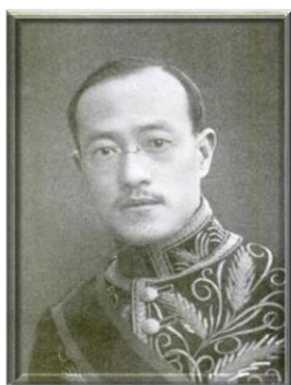
王正廷 Chengting T. Wang

(Note: Hong Kong Governor Sir Andrew Caldecott was a former Rotarian---Charter President 1929-1930 of The Rotary Club of Kuala Lumpur, Federated Malay States.)