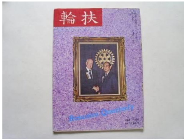
Cover of the 《Rotarian Quarterly》 Issue July 1974

The publication of this official regional magazine (changed to monthly in July 1991) offers the Taiwanese members, of whom Mandarin is their native language, the better avenue in receiving the Rotary information, and the platform for mutual interflow and communications. However, for those members in Hong Kong and Macao who prefer to read English, they might take the liberty on the subscription of the official magazine 《The Rotarian》 from the World Office.