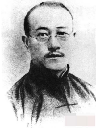
Dr. Chengting T. Wang (Shanghai) (王正廷博士) (上海扶輪社)

On 1 October 1935, The Rotary Club of Hong Kong became one of the 15 constituent clubs in forming the new 81st District of Rotary International. The District Governor was Dr. Chengting Thomas Wang (王正廷博士) ( Shanghai ) ( Diplomat ).