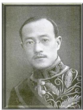
王正廷 Chengting T. Wang