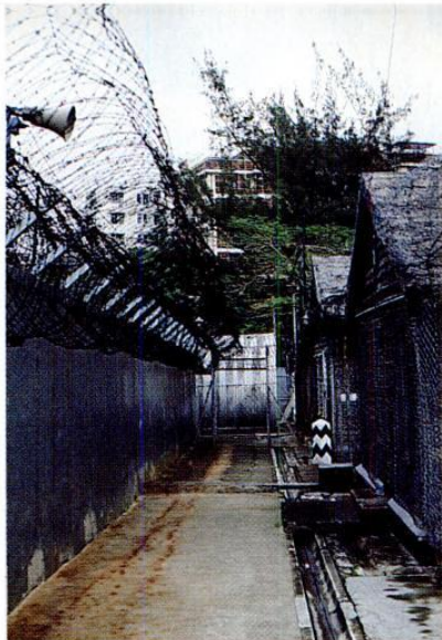
Ominous chain link fences and barbed wire surround the closed camps.