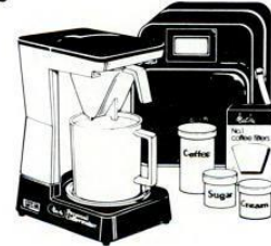
Coffeemaker Travel Kit Model ACM-1T/1