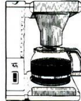
10s Elan 10-Cup Coffeemaker