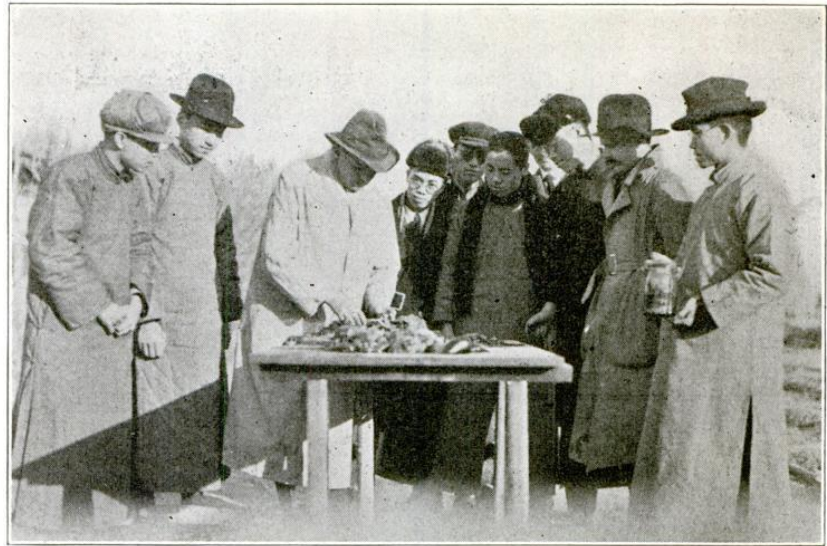
A class of Chinese students receiving training in scientific slaughtering.