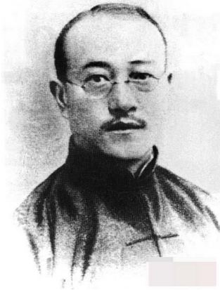
Dr. Chengting T. Wang (Shanghai) (王正廷博士) (上海扶輪社)

On 1 October 1935, The Rotary Club of Hong Kong became one of the 15 constituent clubs in forming the new 81st District of Rotary International. The District Governor was Dr. Chengting Thomas Wang (王正廷博士) ( Shanghai ) ( Diplomat ).