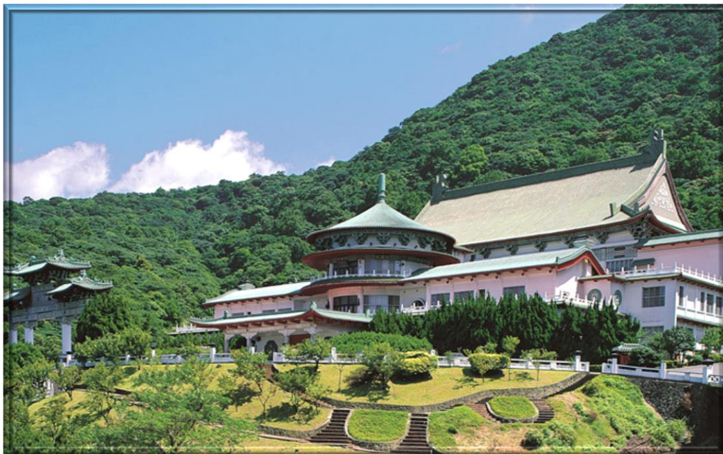
臺北陽明山中山樓 Chung Shan Hall of Yang Ming Shan, Taipei