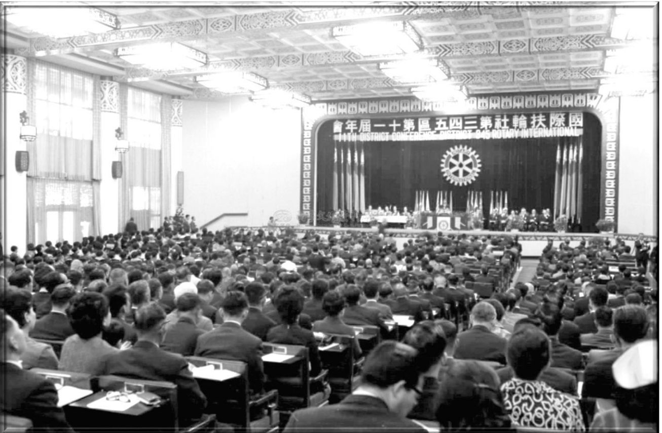
全體會議在文化堂舉行 Plenary session at the Culture Hall