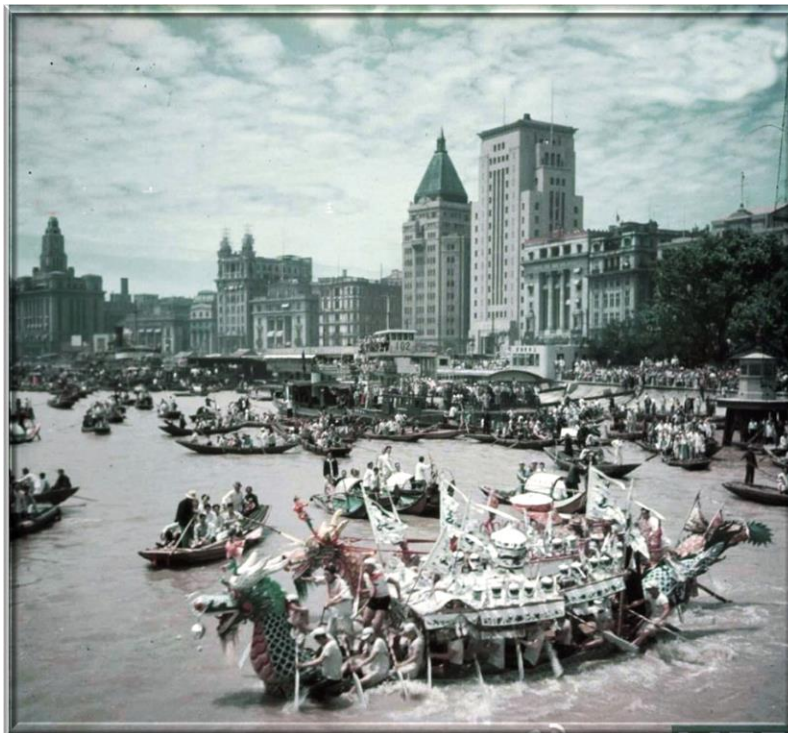
Shanghai in 1948