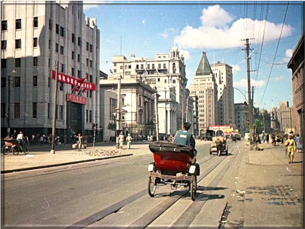
Shanghai in 1950