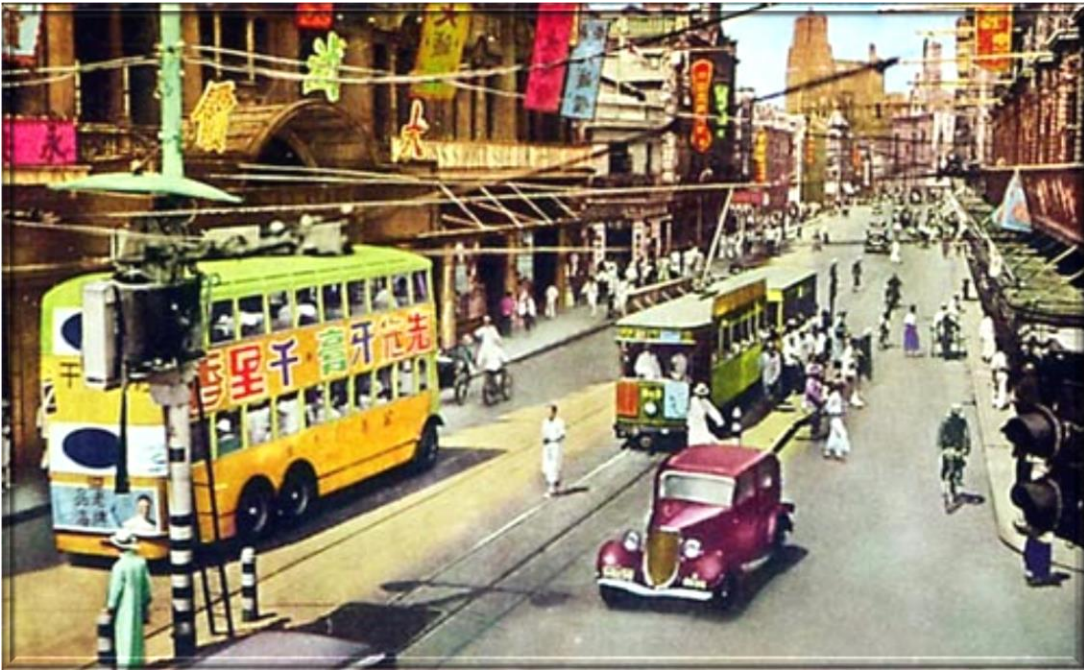
Shanghai in 1948