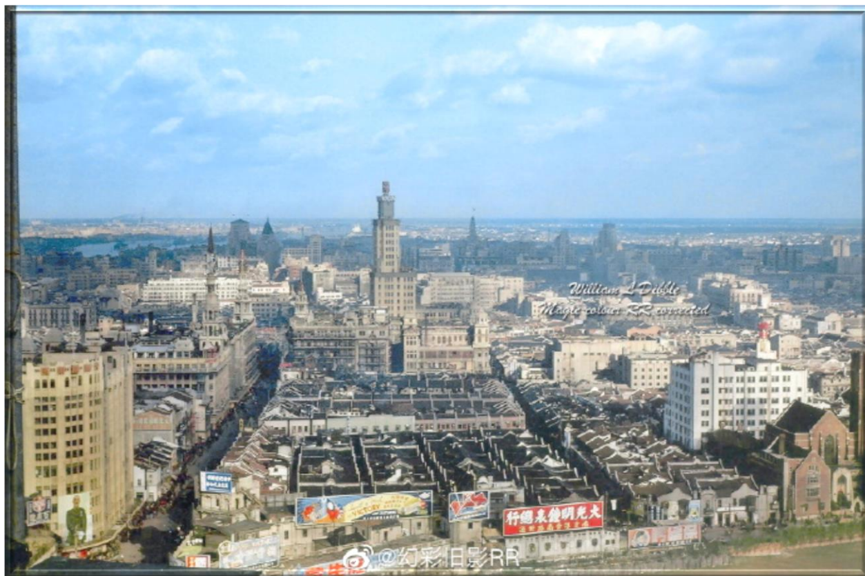
Shanghai in 1948