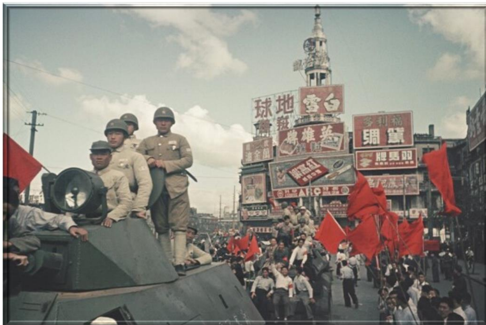
People's Liberation Army troops of the Chinese Communist Party entering Nanking Road, Shanghai, on 25 May 1949 declaring the “socialist liberation”.

Many refugees never made it. In December 1948, the steamer Kiangya (江亞輪) sank in the Huangpu River (黃浦江) with an estimated 2,000-3,000 passengers drowning — a higher death toll than the Titanic. The PLA arrived on 25 May 1949 and Shanghai was “liberated”. By then a million people, unable to see any accommodation with the Communists, had left China via Shanghai. In addition, many of the 2 million Nationalist troops fleeing to Taiwan did so through the city.