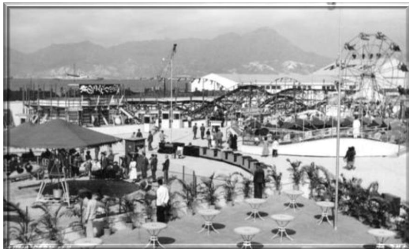
Roof top amusement park, Luna Park, North Point, Hong Kong.