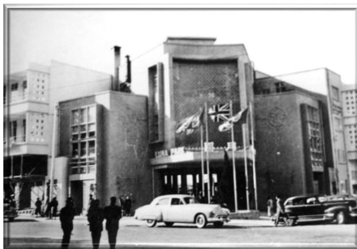
Luna Park located at North Point, Hong Kong (1949-1954)