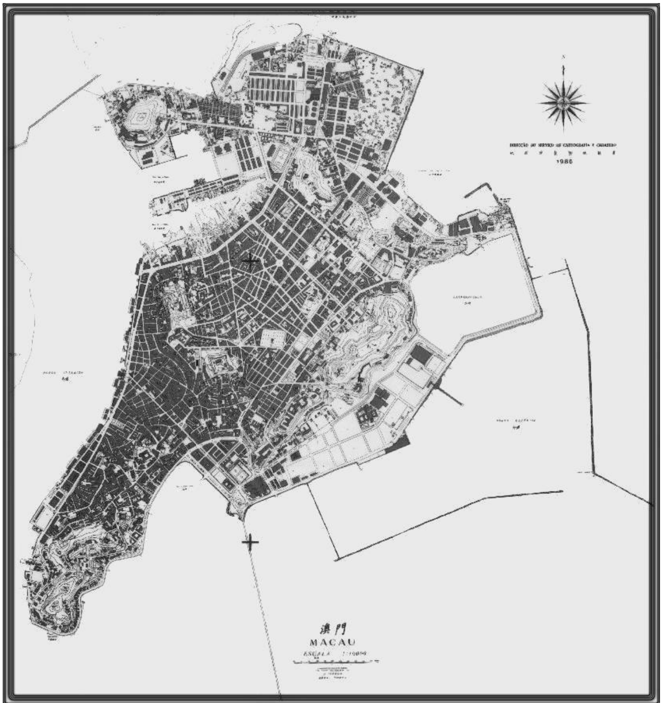
Map of Macao as on 1 July 1987 when was the partial territory of the District 345 Rotary International