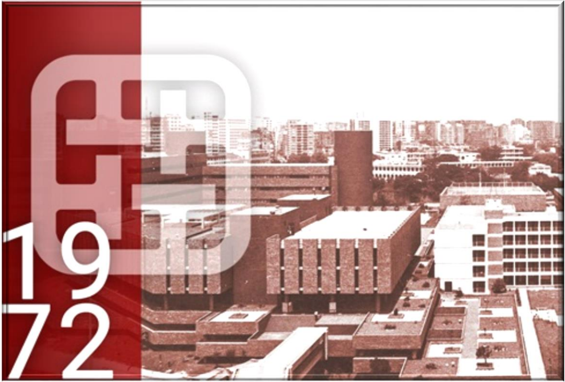
Hong Kong Polytechnic in 1972