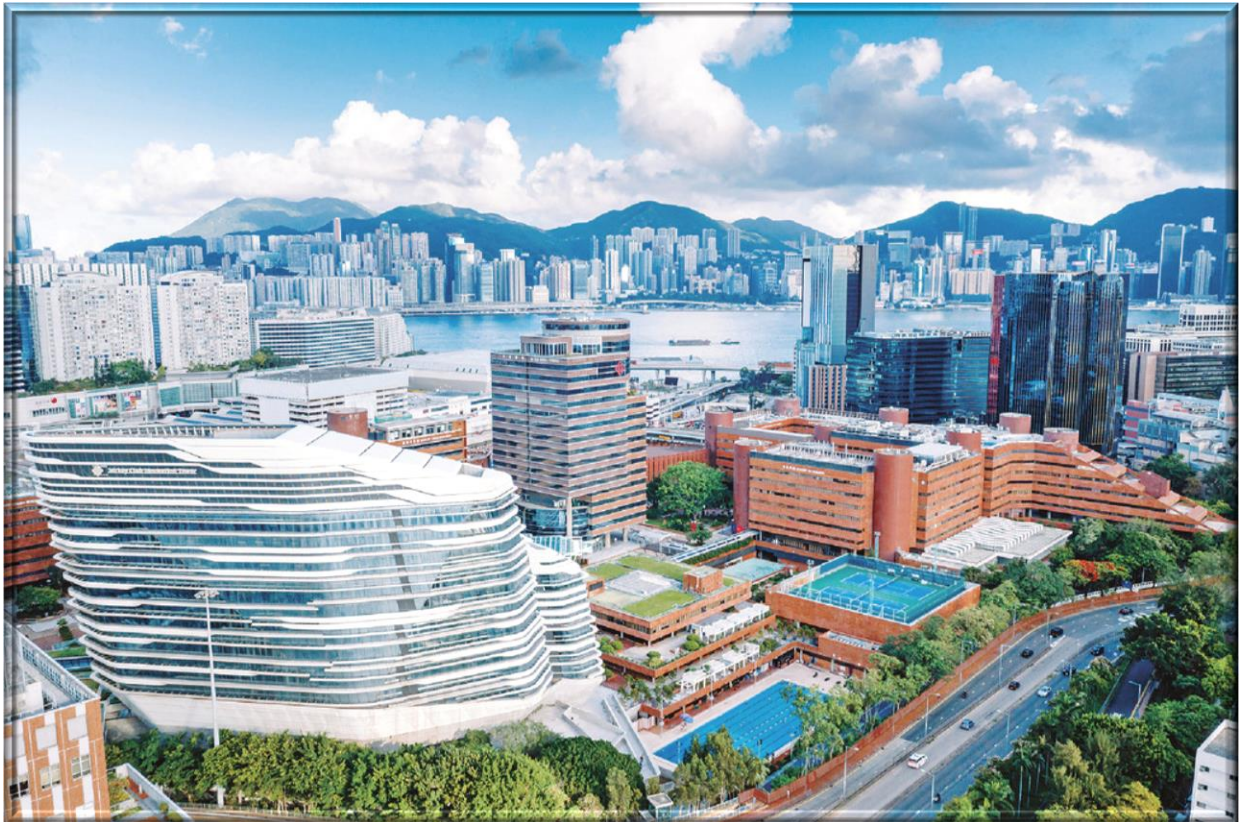
Hong Kong Polytechnic University -- Landscape of the main campus in Hung Hom today