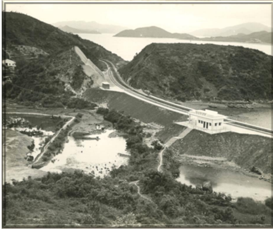
馬料水火車站於 1955 年 8 月落成，為日後的崇基學院老師學生提供服務。 Ma Liu Shui Railway Station was built on August 1955 to serve the new campus of Chung Chi College.