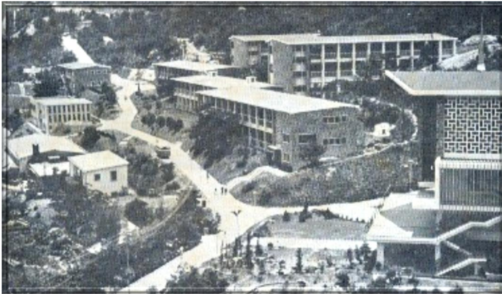
50 年代至 60 年代的崇基學院校園。 Chung Chi College Campus in the 1950s-1960s.