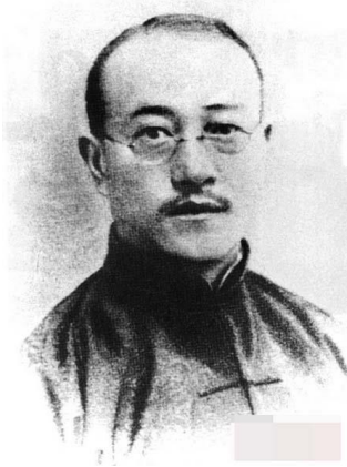
Dr. Chengting T. Wang (Shanghai) (王正廷博士) (上海扶輪社)

On 1 October 1935, The Rotary Club of Hong Kong became one of the 15 constituent clubs in forming the new 81 st District of Rotary International. The District Governor was Dr. Chengting Thomas Wang (王正廷博士) ( Shanghai ) ( Diplomat ).