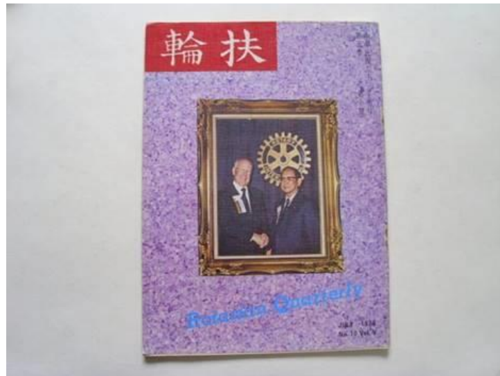
Cover of the 《Rotarian Quarterly》 Issue July 1974

The publication of this official regional magazine (changed to monthly in July 1991) offers the Taiwanese members, of whom Mandarin is their native language, the better avenue in receiving the Rotary information, and the platform for mutual interflow and communications. However, for those members in Hong Kong and Macao who prefer to read English, they might take the liberty on the subscription of the official magazine 《The Rotarian》 from the World Office.