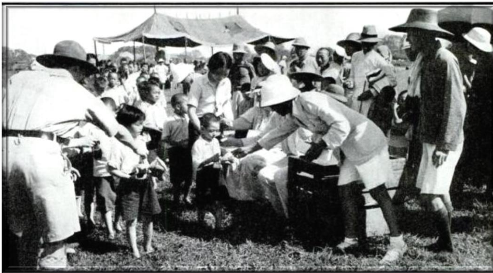
These war orphans found there was still fun left in the world when Hankow Rotarians took them on an outing with donkey rides, juggling acts, and lemonade too! – provided an afternoon they'll long remember.

Rotary clubs abroad, mainly those in America and Great Britain, responded generously to the appeal of the Hankow Club for funds to do relief work. The work was handled by the International Red Cross under the supervision of the Club. The Hankow Club has done a great deal in giving relief to poor and refugee children by entertaining them with outings, games, good treats, and looking after them in a general way. We held a field day for 'Warphans'. The Club also gave them medical aid and toys."