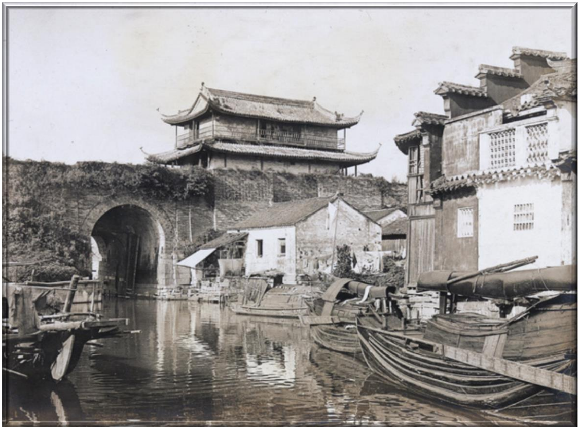
Watergate through city walls and waterside buildings, Soochow