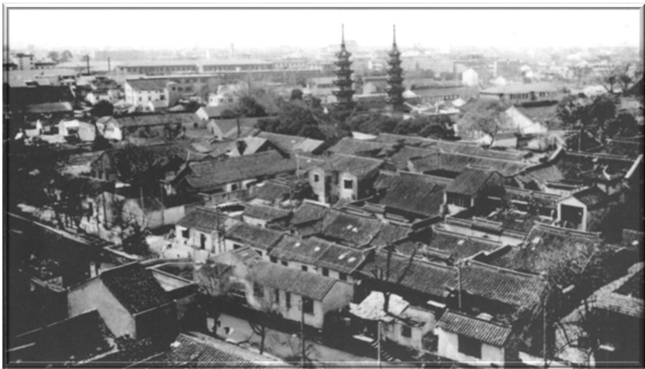
Soochow as in 1936 1936 年的東吳