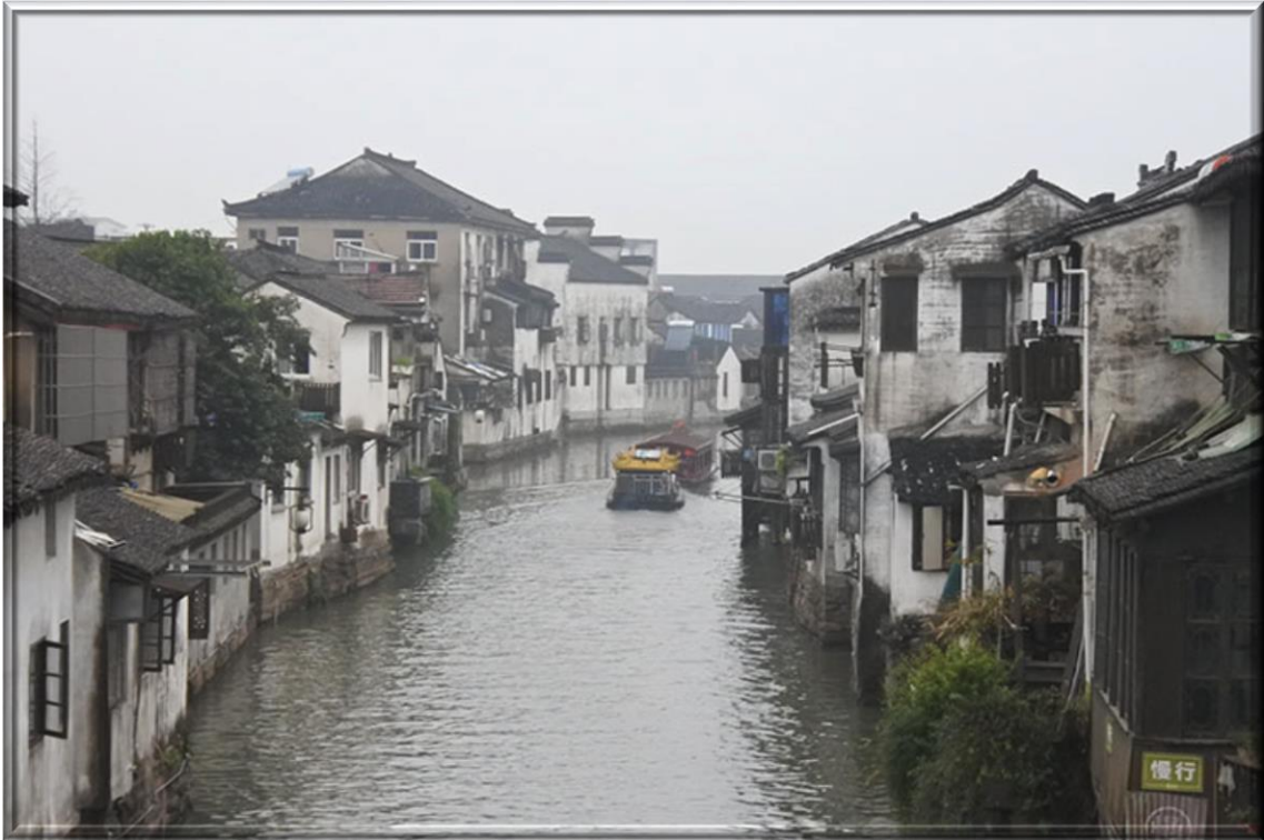
Water streets in Soochow