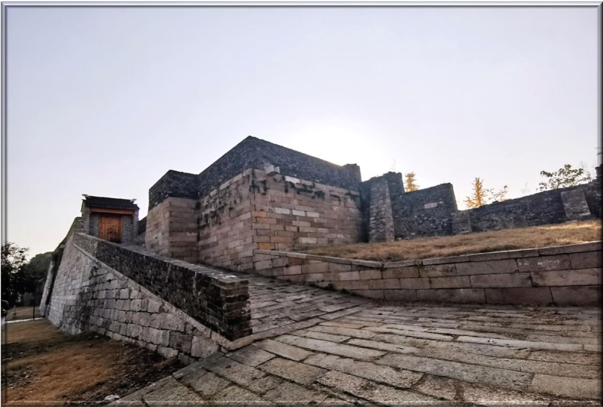
Xū Gate (胥門) where the Soochow Rotary Club was located behind this city wall.