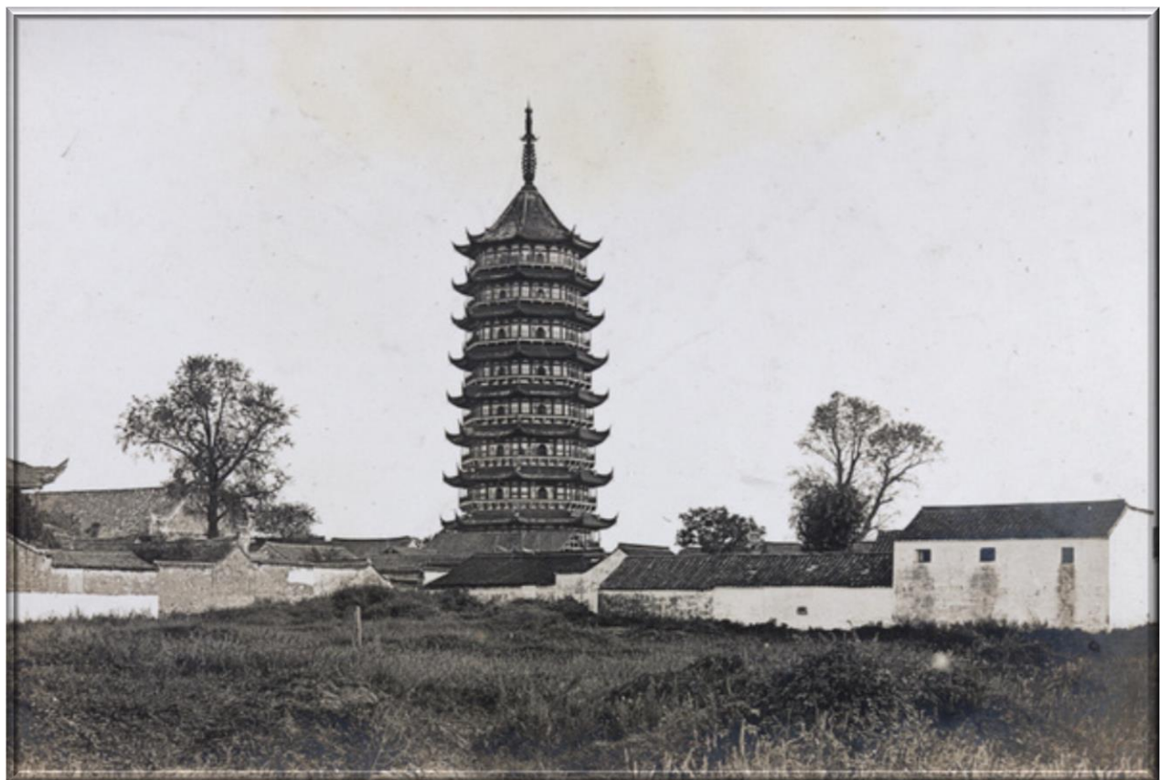
North Temple Pagoda, Soochow 「吳中第一古剎」報恩寺塔（北寺塔）