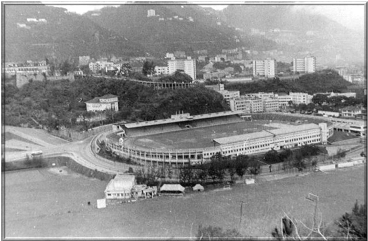
South China Athletic Association Caroline Hill Stadium in the 1950's