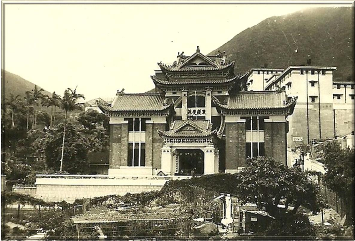
This photo shows Tung Lin Kok Yuen (東蓮覺苑) in the 1930's. The name "Tung Lin Kok" was taken from the names of the couple "Ho Tung 何東" and "Lin-Kok 蓮覺", and "Yuen 苑" is literally meaning "nunnery".